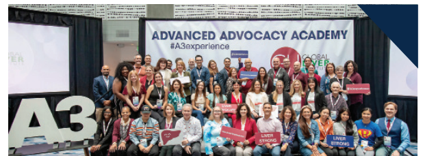
2023 A3: The Learning Experience participants