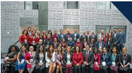
2023 A3 alumni before heading to Capitol Hill for advocacy meetings