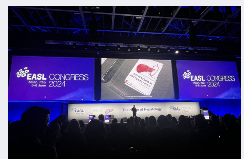
EASL congress, Milan, Italy