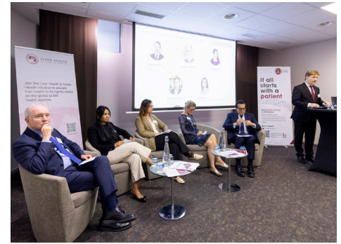
Together for Better Liver Health, WHA77 side event, Geneva, Switzerland