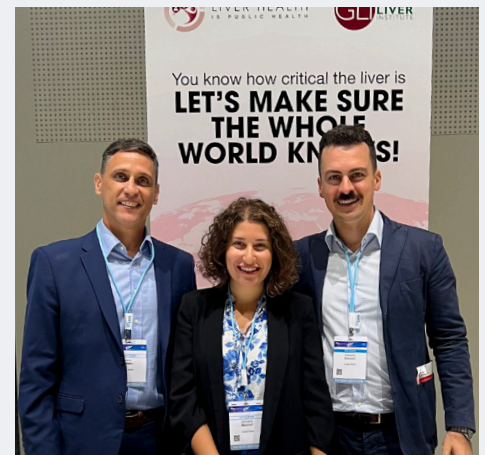
EASL congress, Milan, Italy