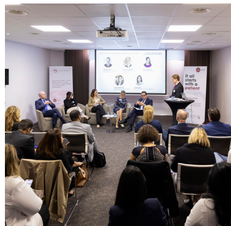
Together for Better Liver Health, WHA77 side event, Geneva, Switzerland